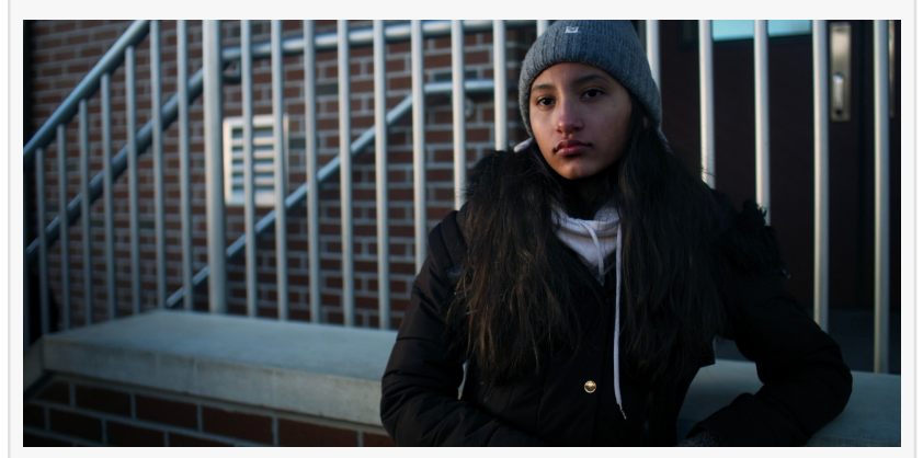
A Real Job