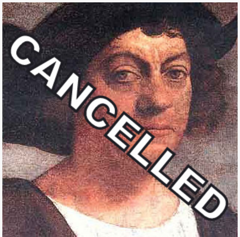
Randolph NJ School Board Nixes Columbus Day

There was immediate backlash by parents and residents who contacted Board members opposing the hasty change to the school calendar and demanding Columbus Day be reinstated. In subsequent conversations certain Board members admitted the process may have not