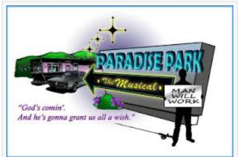
Paradise Park - The Musical

This press release can be viewed online at: https://www.einpresswire.com/article/542874666