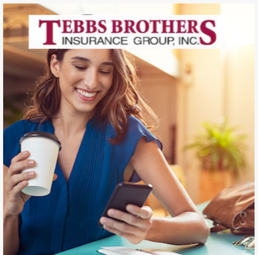
TEBBS Bros: UTAH's #1 BUSINESS Home Life Auto INS