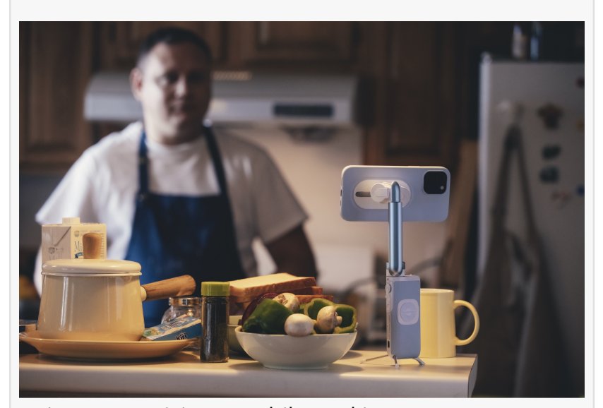
Using PowerVision S1 while cooking