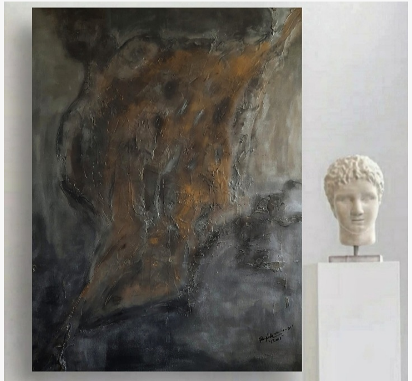
Mars by QueenNoble