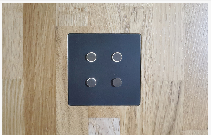
Wall-Smart Solid Surface mount for Lutron Alisse Keypads

Wall-Smart is the leading designer and manufacturer of custom flush ceiling and wall mounts for high-end home electronic devices, including tablets, touchscreens, Wi-Fi access points, security cameras, voice assistants, and more. Dedicated to providing cutting-edge, creative, and cost-effective concealment solutions for technology in new and existing homes, Wall-Smart inspires