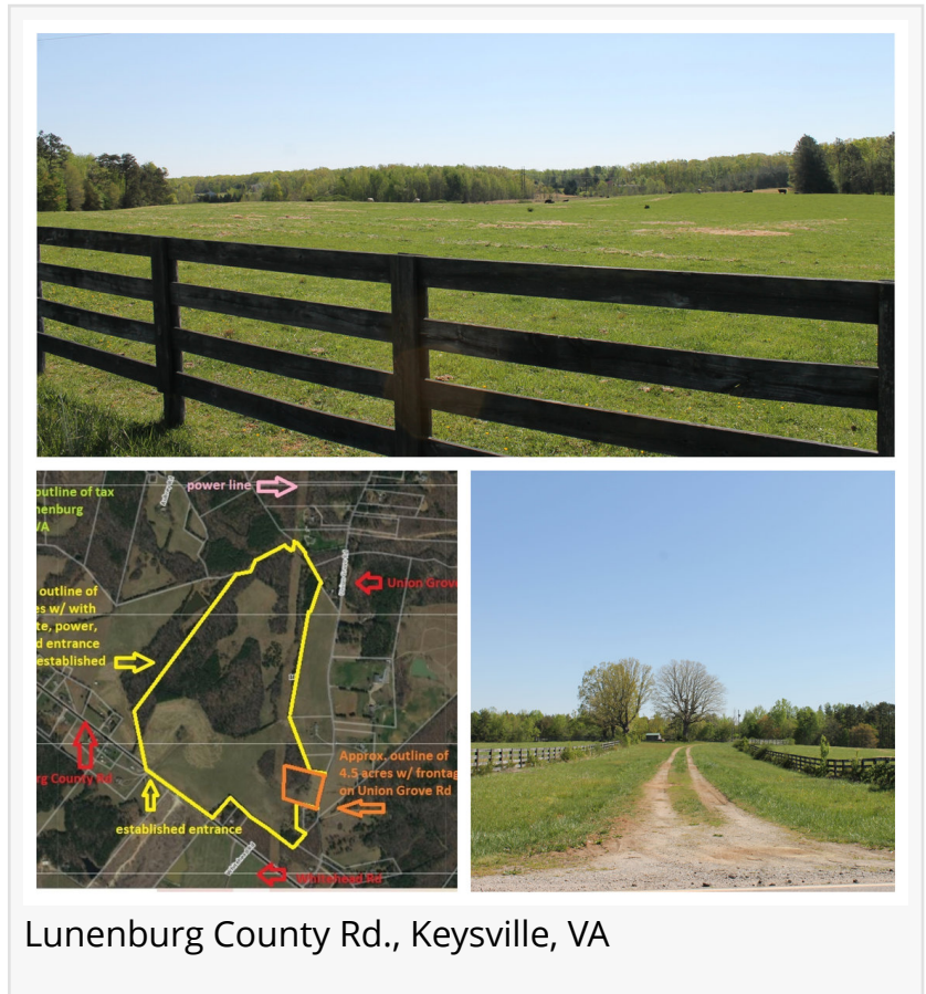
Lunenburg County Rd., Keysville, VA