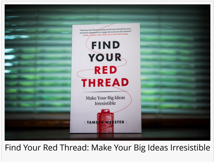
Find Your Red Thread: Make Your Big Ideas Irresistible