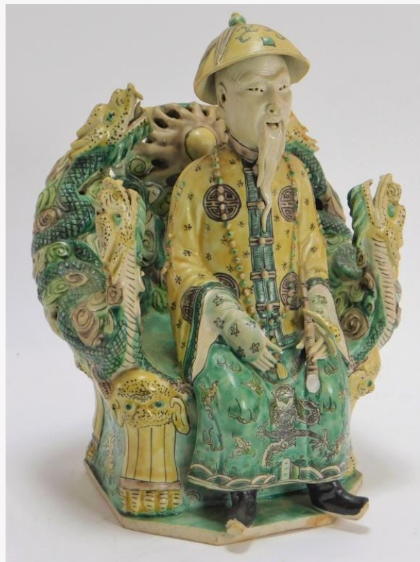
19th century Chinese porcelain Sancai statue of a seated bearded man (or emperor), decorated with a five-toed dragon upon a dragon throne. Estimate: $1,000-$2,000.