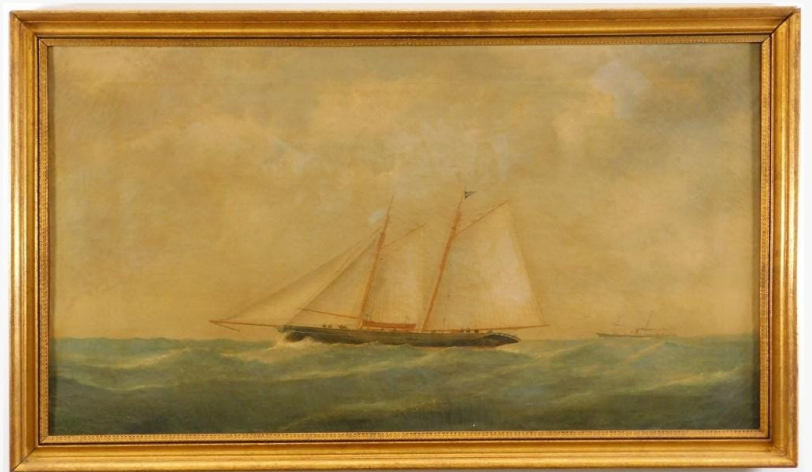
Oil on canvas maritime ship painting attributed to Thomas Buttersworth (English, 1768-1842), depicting a sailing vessel cutting through choppy waves. Estimate: $1,000-$2,000.