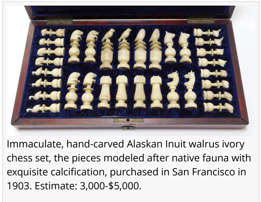
Immaculate, hand-carved Alaskan Inuit walrus ivory chess set, the pieces modeled after native fauna with exquisite calcification, purchased in San Francisco in 1903. Estimate: 3,000-$5,000.

CRANSTON, RI, UNITED STATES, June 7, 2021 /EINPresswire.com/ -- An online-only Estate Fine Art & Antique auction packed with over 300 quality lots, mostly pulled from prominent estates throughout New England, is planned for Thursday, June 17th, by Bruneau & Co. Auctioneers, which has been hosting successful Internet sales since the start of the pandemic but is looking forward to resuming live, in-gallery events.