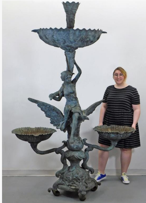
Early 20th century bronze Art Nouveau three-basin fountain, 92 inches tall by 62 ½ inches wide, depicting a bare breasted woman sitting atop an eagle. Estimate: $2,000-$3,000.

An oil on board tonalist winter scene by John Fabian Carlson (N.Y./Colo./Sweden, 1875-1945), 8 inched by 10 inches (sight, less frame) and artist signed "J. F. Carlson" lower left, carries an