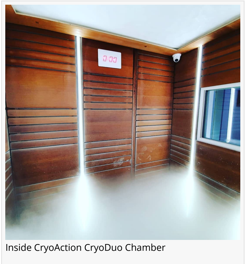
Inside CryoAction CryoDuo Chamber

The cryotherapy chamber designer and manufacturer, which is the official cryotherapy supplier to global sports franchises and brands, spas, wellness, health, and fitness centers, has agreed distribution deals with 21 different businesses, spanning across 40 countries.