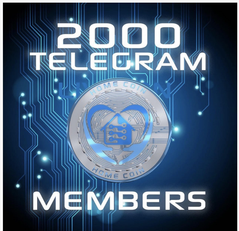
Tokenomics with a purpose