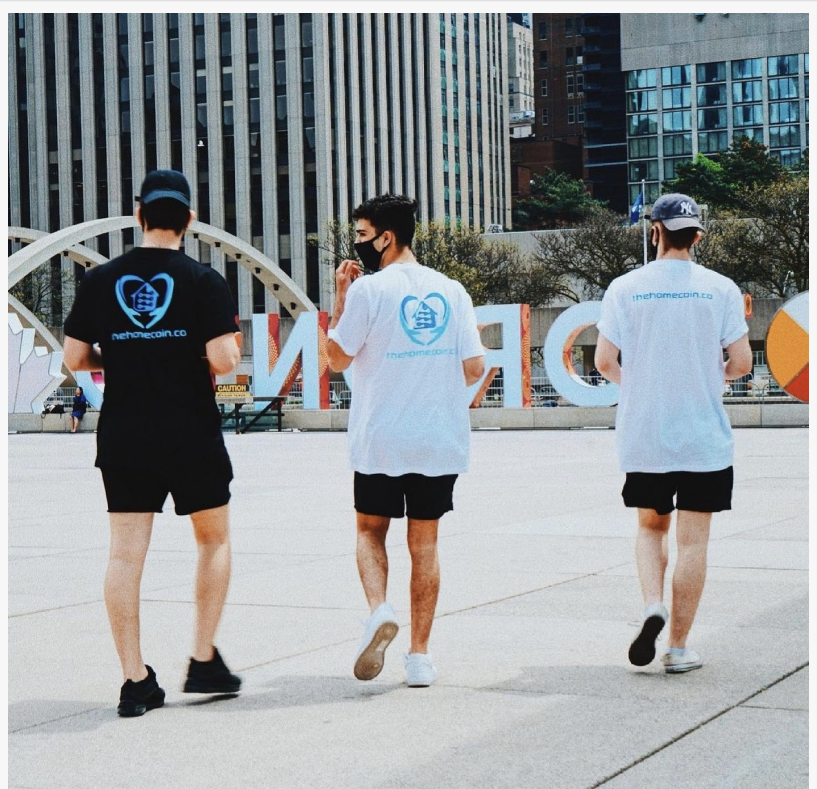
HomeCoin saves lives

Although the process of purchasing seems daunting through the lens of a first-time investor, it is rather straightforward. To buy HomeCoin, investors must set up a cryptocurrency wallet through an exchange of their choosing. One must then buy BNB, Binance's cryptocurrency, which can be