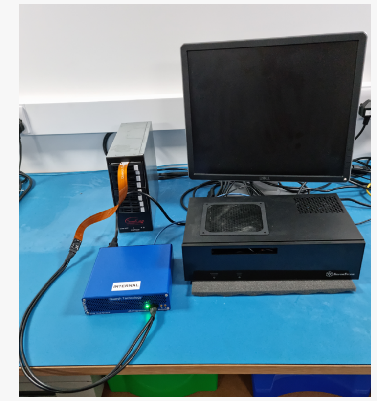
A standard test station was used to set up all drives

Quarch Technology Ltd is a world-leading supplier of automated test tools for Storage Systems. Scalable test systems enable manufacturers and re-sellers of data storage to get to market faster with a more reliable product. Their groundbreaking and highly customizable solutions can be tailored to our customer's needs, allowing the system to achieve a very rapid return on investment in any test