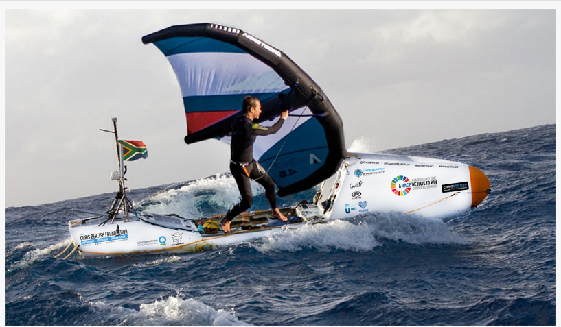
G100 Visionary and Founder of Chris Bertish Impossible, Chris Bertish

Genius 100, referred to as G100, was born out of the centennial celebration of Einstein's Theory of Relativity (2016). To honor this landmark occasion, 100 of the world's greatest minds were researched, selected, and nominated to contribute their vision of the future to the publishing of the first 3D book "Genius: