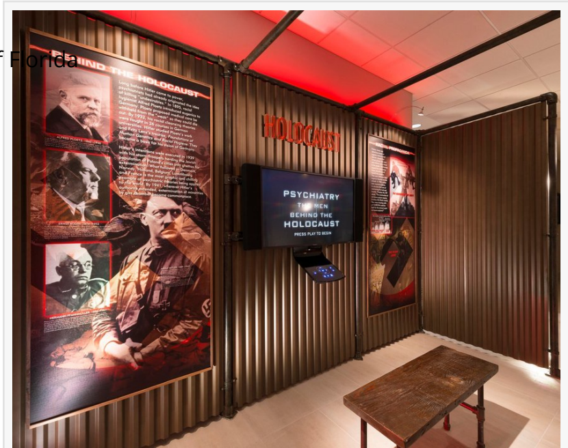
The Psychiatry: An Industry of Death museum is open daily in downtown Clearwater, Florida