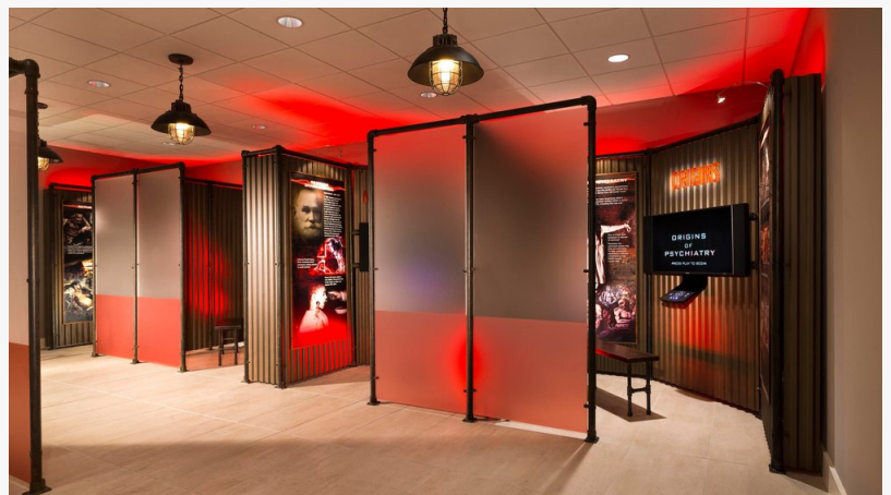
The museum presents the unvarnished history of psychiatry across fourteen audio-visual displays, each revealing another aspect of psychiatric abuse and violations of human rights.

This press release can be viewed online at: https://www.einpresswire.com/article/543287607