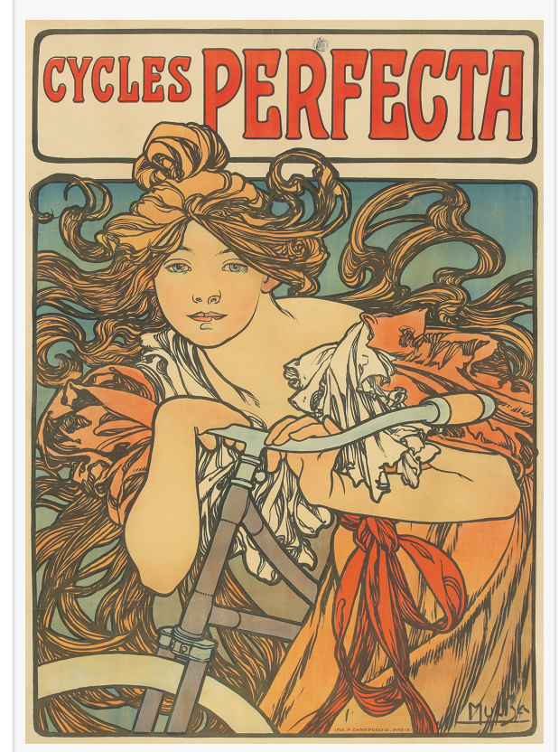
Alphonse Mucha, Cycles Perfecta (1902). Estimate: $25,000-$30,000.