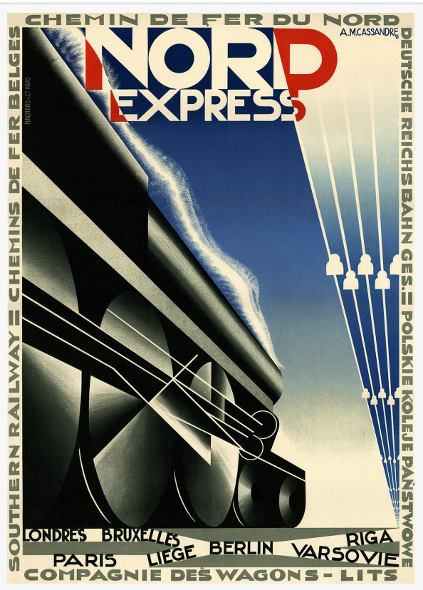
A. M. Cassandre, Nord Express (1927). Estimate: $20,000-$25,000.

The War & Propaganda section will include a century of powerful designs, beginning with an anonymous 1861 design, Spirit of the North, created at the onset of the American Civil War (est. $2,000-$2,500). Several American World War I posters will be offered, including Louis Fancher's 1917 U.S. Official War Pictures (est. $3,000-$4,000). From World War II, a very rare American design will go to auction: the