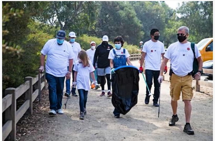
Team sets off to clean up abandoned campsites.