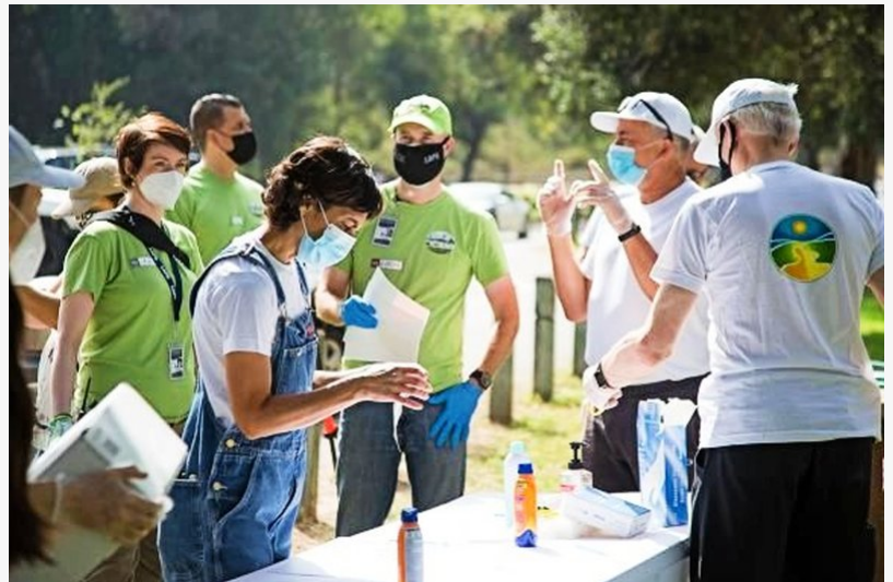
Volunteers gathered near the Los Angeles Zoo to begin the cleanup.

Before the cleanup, organizers met with Griffith Park Rangers to determine what help they need