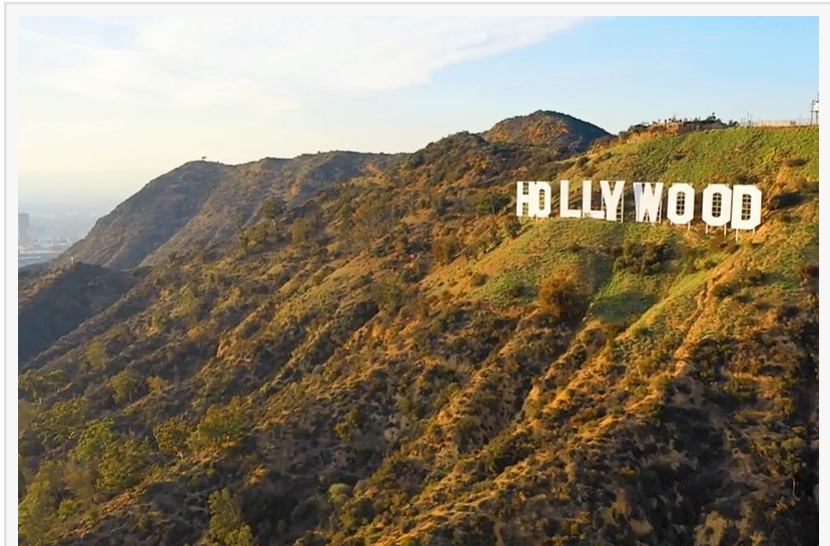
Hollywood Village June 2021 cleanup on World Environment Day targeted debris that could cause wildfire in Griffith Park.