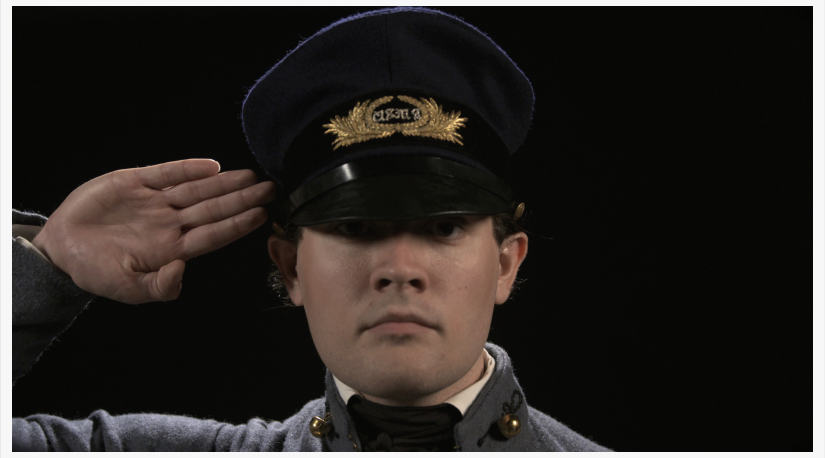
Uniform of a West Point Cadet circa 1860

Uniform History of the U.S. Army - Vietnam 1965