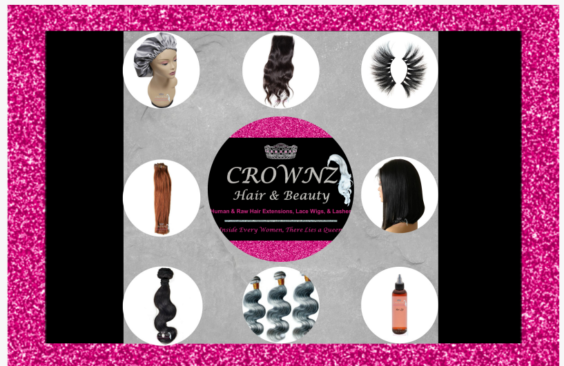
CROWNZ Hair and Beauty Products