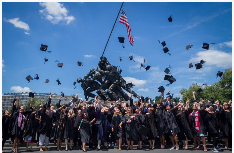
2018 Graduates Celebration