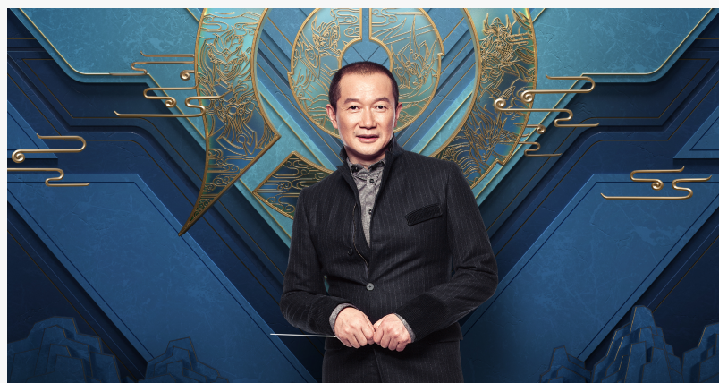
Grammy and Academy Award winner Tan Dun is one of the featured composers on the album