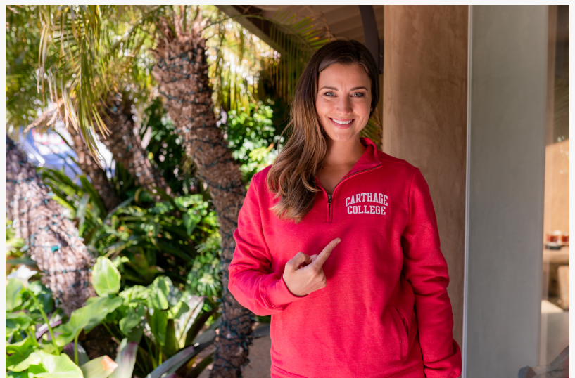
A Proud Carthage College Alum

Laura Kaeppler, Miss America 2012 and 2010 graduate of Carthage College