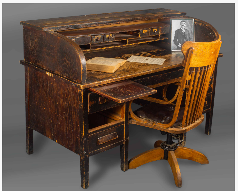
1880s roll-top desk and chair used by Pat Garrett as Dona Ana County, New Mexico sheriff from 1896-1900, in poor condition but able to be refurbished. Estimate: $10,000-$20,000.