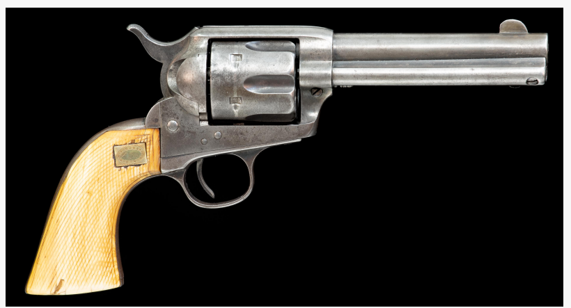
Colt single-action Army revolver with one-piece ivory grips made in 1895, originally owned by O. Frank Hicks, who enlisted in the Arizona Rangers in 1905. Estimate: $20,000-$25,000.

Major categories will include cowboy antiques and collectibles (saddles, spurs, bits, etc.); Native American artifacts; antique and historic firearms; Hollywood cowboy memorabilia; Western fine art; Old West gambling and saloon items; antique and contemporary belt buckles and other silverwork; antique advertising and lithography; and Western decorative arts and furniture. The auction is free and open to the public, but seating is limited. Reservations are required for a seat.