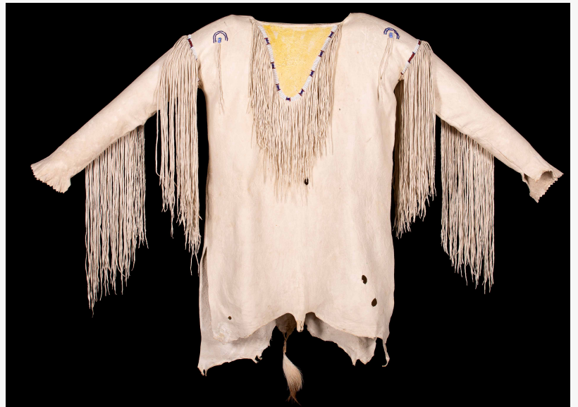
Circa 1920-1930 Native American Kiowa tanned and sinew-sewn deer hide shirt with 17-inch-long fringe, deer tail hanging from the back and decorative beadwork. Estimate: $7,000-$9,000.