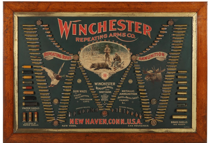
Winchester 1887 cartridge display board, American, among the most highly sought and iconic American sporting advertising cartridge boards (CA$88,500).