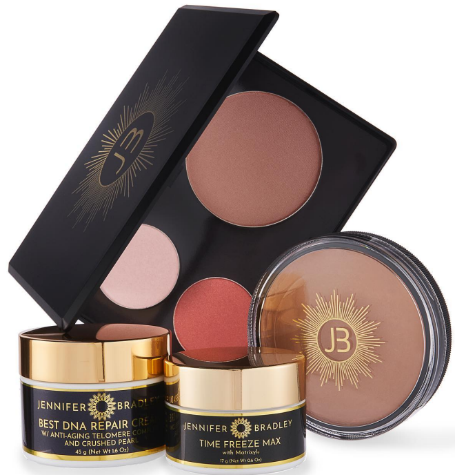
Jennifer Bradley Skincare & Cosmetics

Jennifer Bradley Skincare & Cosmetics products include an anti-aging skincare line and an acne-healing skincare line, as well as mindfully crafted cosmetics, makeup tools and brushes, hair care designed for hair growth, and a luxurious line of jewelry. Skincare and cosmetics can be purchased in bundles, and a complimentary skincare consultation is provided to guide users towards the products that will help target individual challenges. All Jennifer Bradley Skincare & Cosmetics products can be found online at jenniferbradley.com .