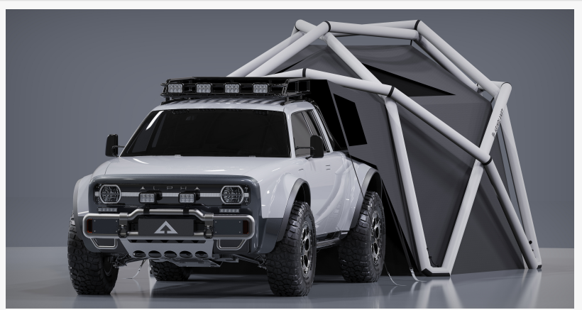
Alpha Motor Corporation © 2021. All Rights Reserved.

HEIMPLANET’s revolutionary outdoor products are available at: www.heimplanet.com