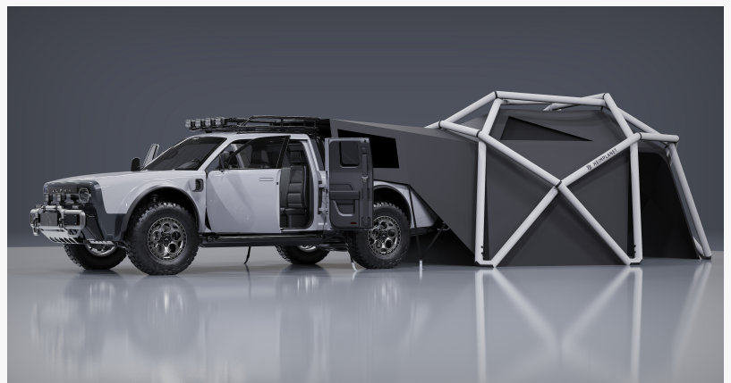
Alpha Motor Corporation © 2021. All Rights Reserved.

IRVINE, CA, UNITED STATES, June 10, 2021 /EINPresswire.com/ -- Alpha Motor Corporation has just unveiled the company's new collaboration with HEIMPLANET called the WOLF+™ Cloudbreak™.