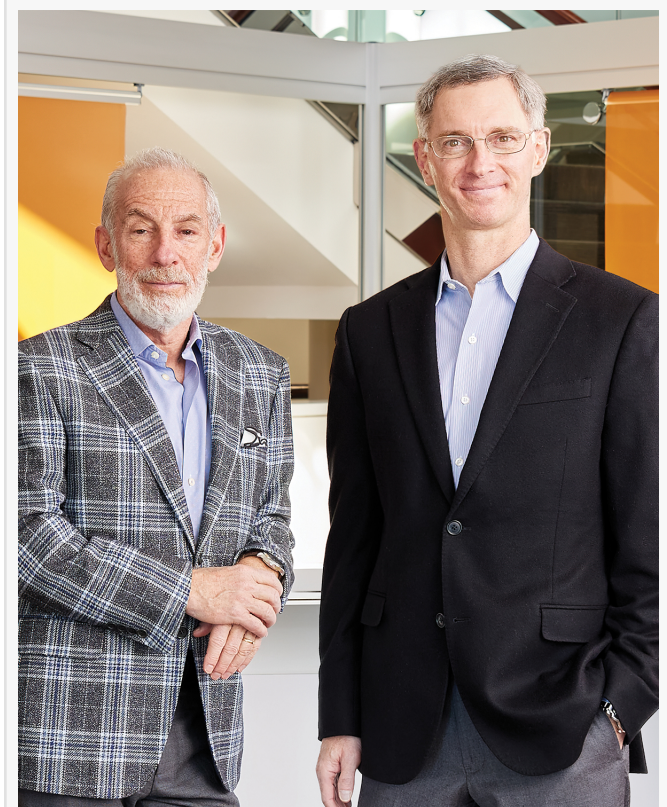
Michelman Leadership Transition

Founded in 1949, Michelman has been an industry leader for over seven decades in developing and applying sustainable and water-based surface modification technology. This leadership transition assures that the company will continue to be family-owned and managed for the long term.