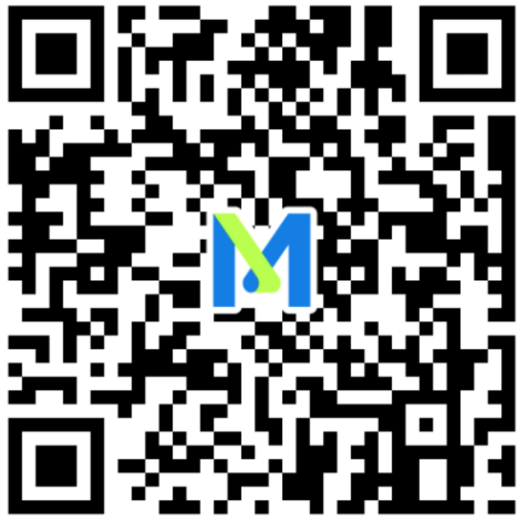
The heart of MeChat: QR Codes

"Entrepreneurship can feel like you're alone and overwhelming with so many hats that leaders have to wear. The journey causes so many to quit before they start, or start