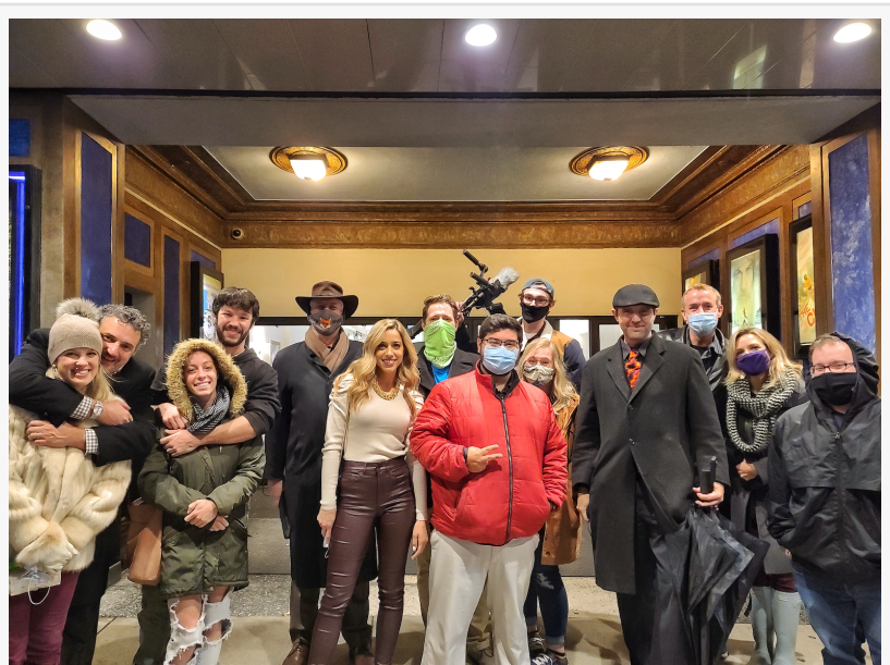
Artists who donated their time to the project during the pandemic

The film opens with scenes from Times Square on NYE 2020, back when everything seemed right with the world. Hugging strangers was commonplace. Then, of course, 2020 unfolded, and social distancing became a 'mandatory' part of everyone's lives, putting many lifelong performers out of work. As the documentary unfolds, it features heartfelt stories, dynamic performances, and powerful gestures of love and connection.