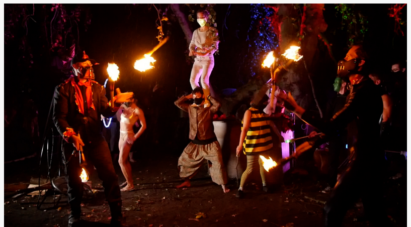
Coalesce celebrates performing artists