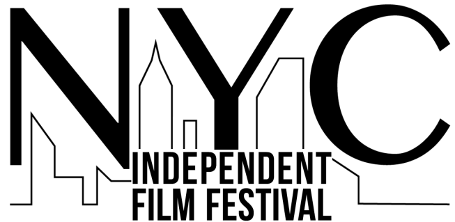
Logo NYC Independent Film Festival