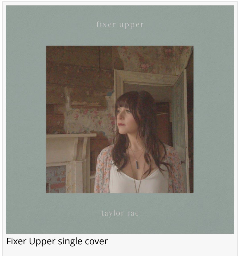
Fixer Upper single cover