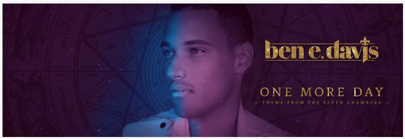
One More Day