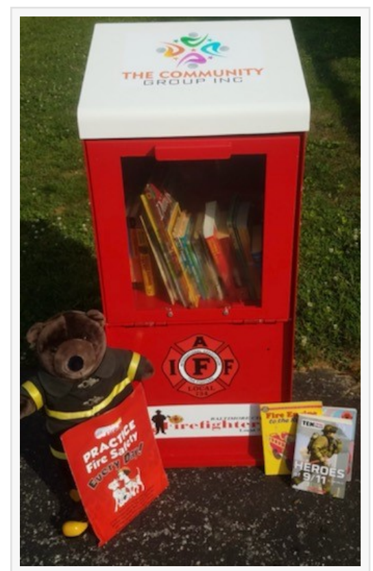
Little Library at Oliver Community Multi-Purpose Center

Baltimore City's first little library will be unveiled on Saturday June, 12, 2021 at 1:00 pm at the Oliver Community Multi-Purpose Center located at 1400 East Federal Street, Baltimore, Maryland 21213.