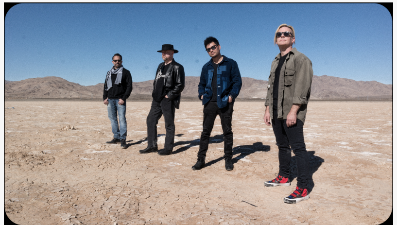
The Jenny Thing