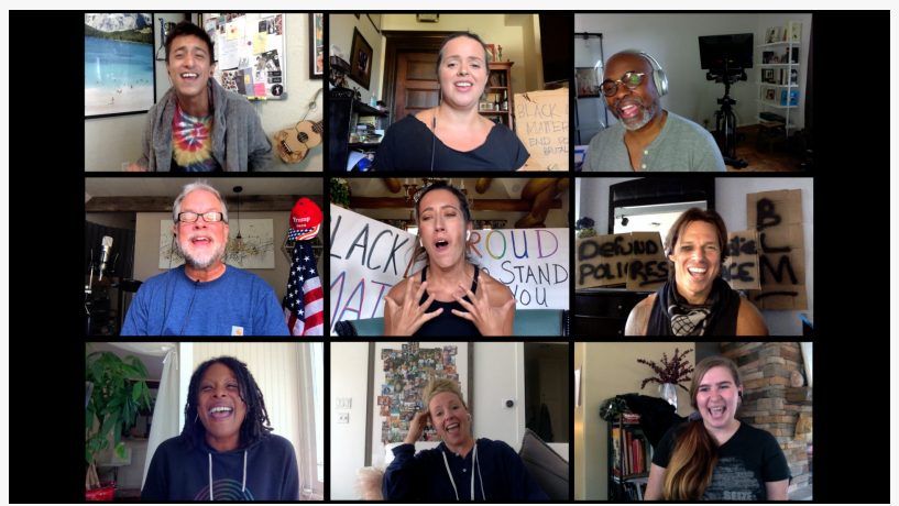
Your Musical Is Cancelled: The Musical!