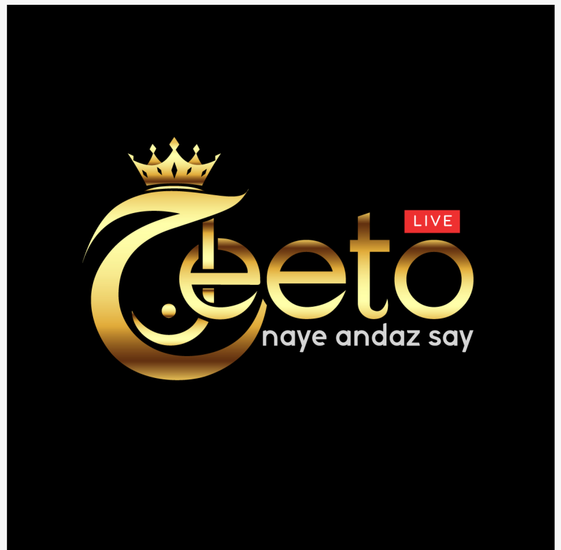
Jeeto Naye Andaz Say

Trivia hosts Pakistan's 1st interactive, live, trivia game show through its mobile app, Jeeto Naye Andaz Say. The multiplayer game show goes live daily at 10 PM PKT where participants are rewarded for completing trivia-based challenges. Thousands of participants from all over Pakistan join the game show for entertainment, learning & rewards.