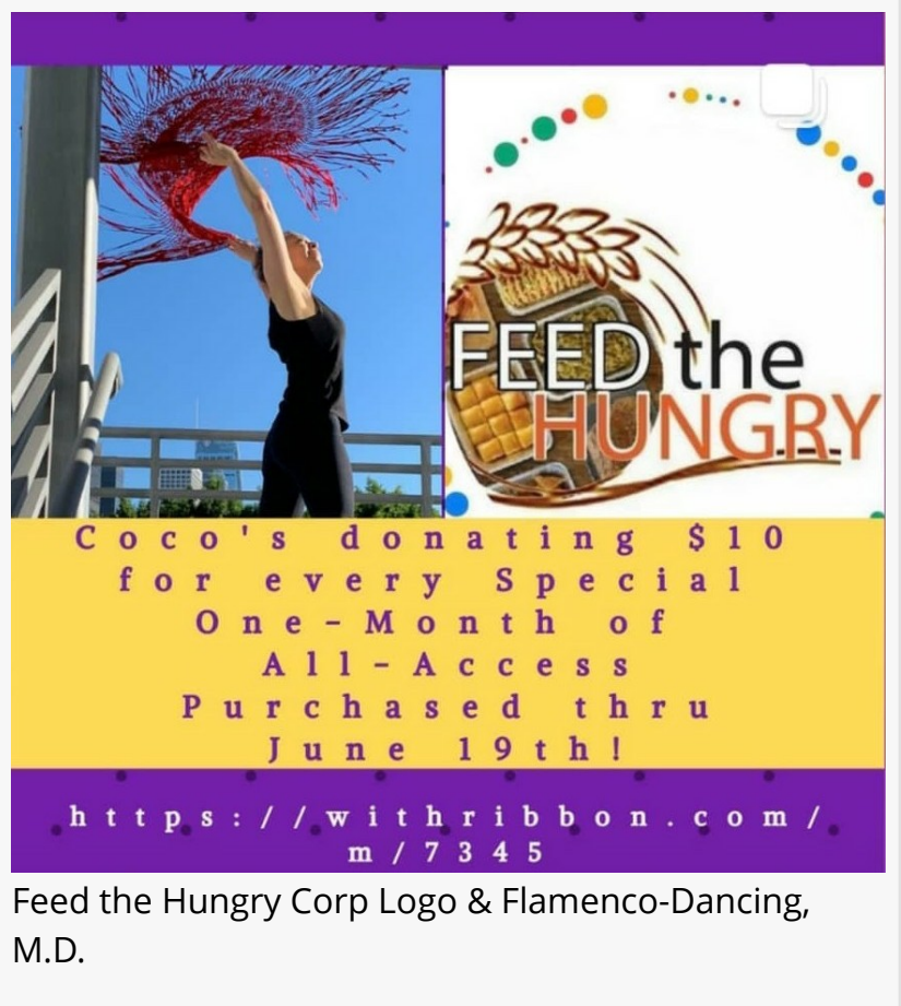
Feed the Hungry Corp Logo & Flamenco-Dancing, M.D.