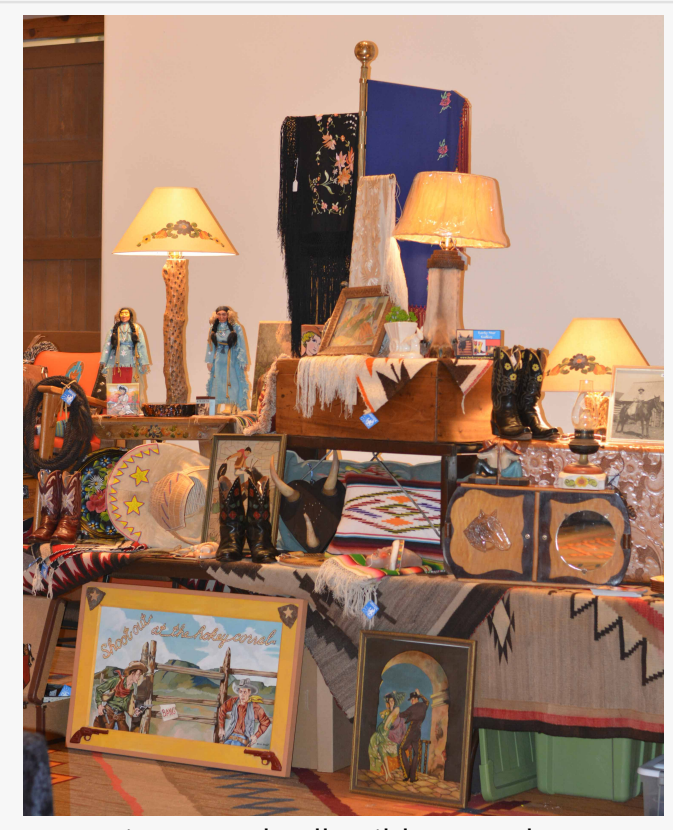
Western antiques and collectibles are always popular.

"Our vendors are among the best in the business, and are extremely generous with both their time and knowledge, Lebel pointed out. "Even if you don't buy anything, you're guaranteed to learn something." Show hours are 9am to 3pm Mountain time on June 26th and 27th, with general admission priced at $10 per day, or $15 for a two-day pass. Those under 12 and over 70 are free.