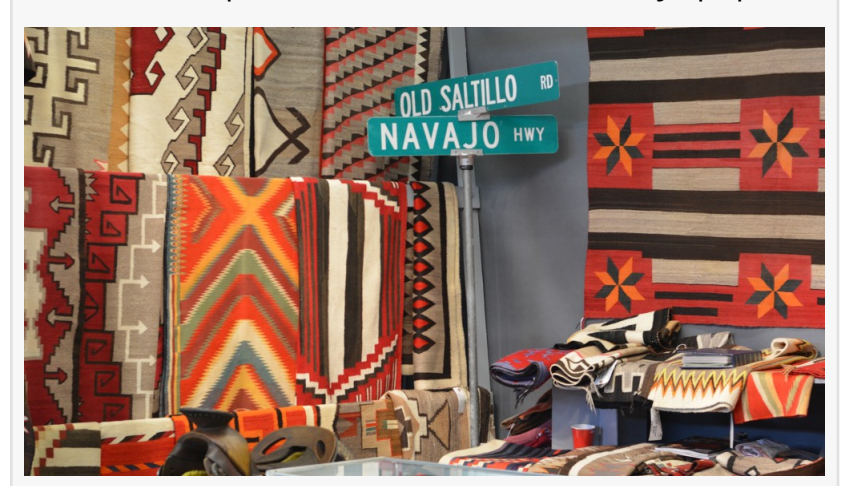
Navajo textiles are abundant and popular at the show, both antique and contemporary examples.

Lebel encouraged attendees to check out early buy-in, which is available "for the serious collector" during Friday's June 25th vendor set-up, from 9am to 5 pm. Guests get to shop while the dealers unpack, for first-look at the merchandise. The cost is $100 and entitles the buyer to access during all vendor hours all weekend, as well as an invitation to the Friday night VIP party.