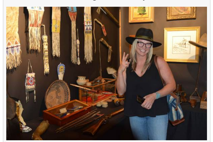
Native American artifacts are among the show's mainstays.

Western fine art; Old West gambling and saloon items; antique and contemporary belt buckles and other silverwork; antique advertising and lithography; and Western decorative arts and furniture. The auction is free and open to the public, but seating is limited. Reservations are required for a seat.