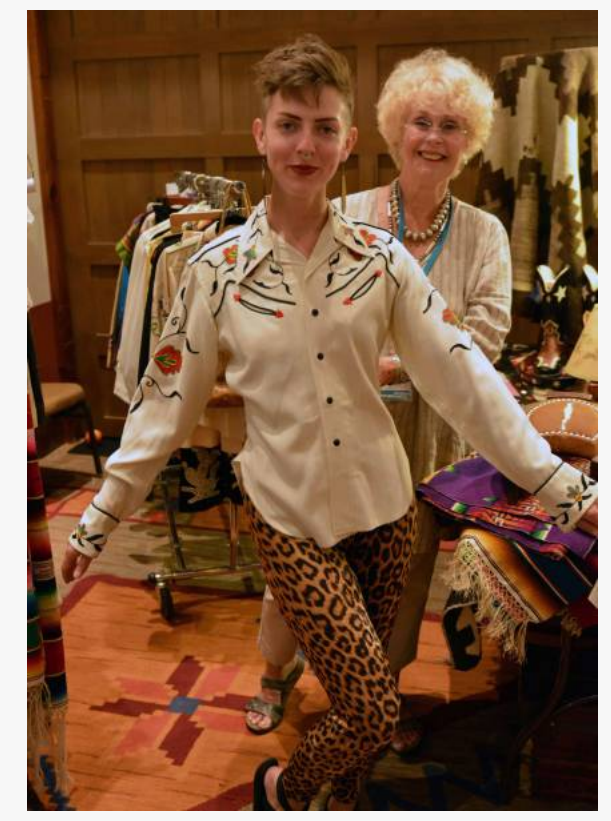
Western fashion never goes out of style.

Major categories will include cowboy antiques and collectibles (saddles, spurs, bits, etc.); Native American artifacts; antique and historic firearms; Hollywood cowboy memorabilia;