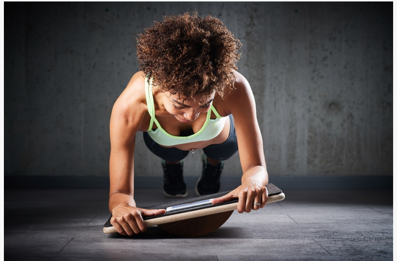
Playfully balance your forearm support on the Plankpad

world's first app-supported total body trainer that combines workouts with games. The playful element is Plankpad's secret weapon against the biggest enemy of all exercisers: overcoming your inner badass and completing workouts regularly. Instead of just fighting the clock, the app (available for iOS and Android) motivates intense workouts through varied games. Simply place your smartphone or tablet on the board, lean on it in the plank position, and control the games through your movements. The games challenge your playful ambition and distract you from the