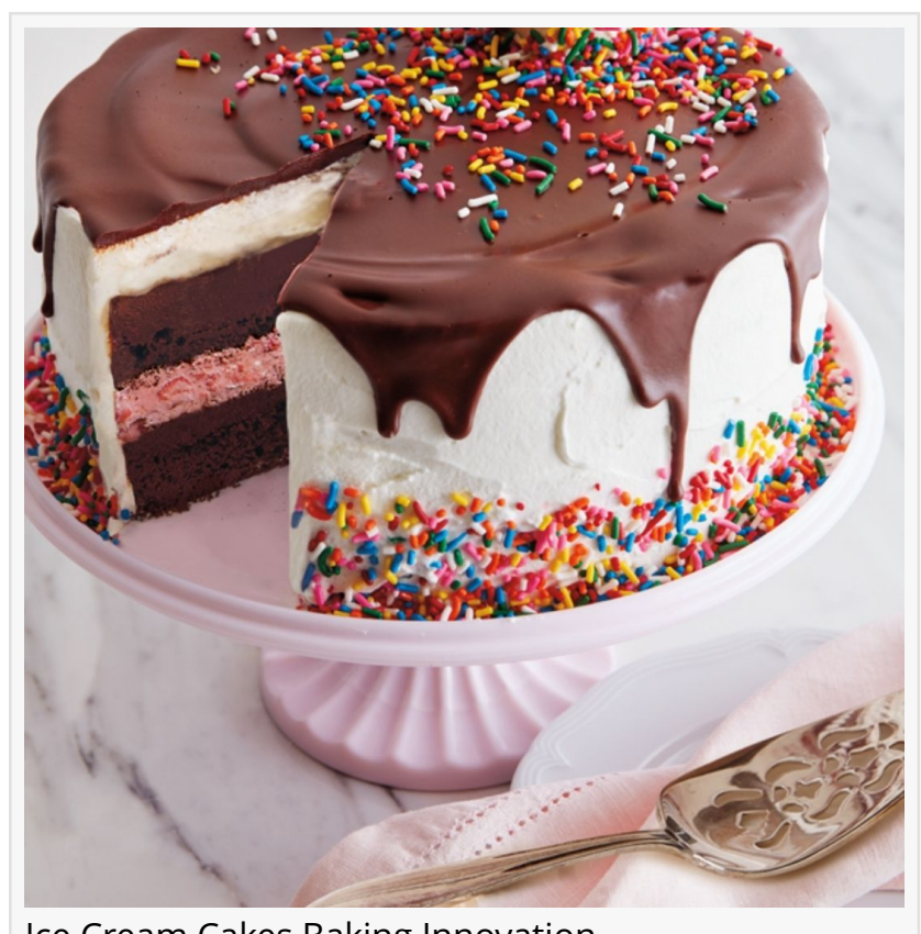
Ice Cream Cakes Baking Innovation

LONDON, LONDON, UNITED KINGDOM, June 15, 2021 /EINPresswire.com/ -- Today Britain Loves Baking unveiled its 2021 summer collection with a raft of new baking innovations including a range of boozy Classic Cocktail Cake Making Kits, quick & easy Single Bake Boxes featuring a ready in 20-minute Orange Chocolate Chip Cookie Kit. For the inner chocolatier there is a Chocolate Making Kit and as a homage to the famous summer dessert Eton Mess, there is the Make Your Own Mess Box. Lastly bakers get to turn their hand to gelato making with the new Italian Gelato Ice Cream Cakes and Ice Cream Sandwich