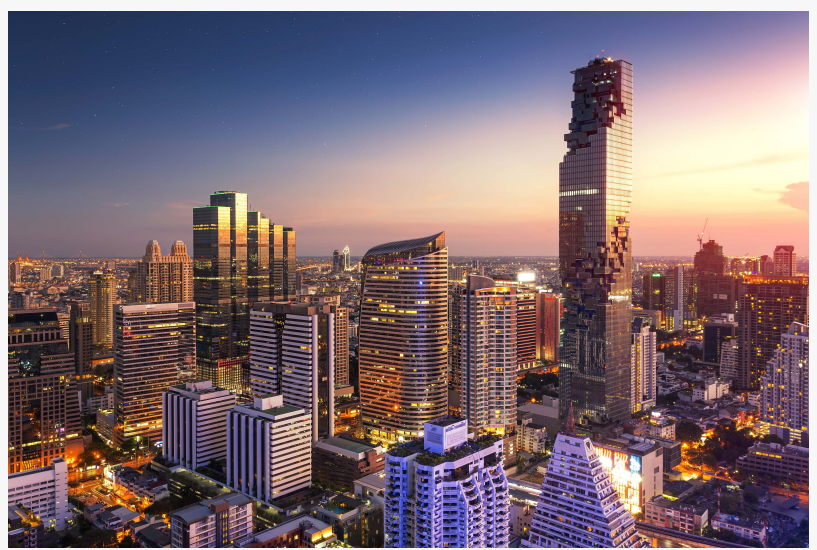
The building spirals up within the Bangkok skyline, iconic and inviting from first look.

architect Jack Charney, who formally studied under the most celebrated modernist architects of the time, including Richard Neutra and Rudolph Schindler. Located at 9255 Doheny Road, the high-profile residence combines two units for a rare opportunity to occupy an entire floor, surrounded by breathtaking views of the Sunset Strip, Downtown Los Angeles, the Hollywood Hills, and Southern California beaches. Walls of glass from the floor to the soaring 15-foot ceilings bring the endless vistas inside, while the raw 7,000 square-foot interior space combined with the 4,000 square-foot interior space is a magnificent canvas to curate the buyer's personalized vision.