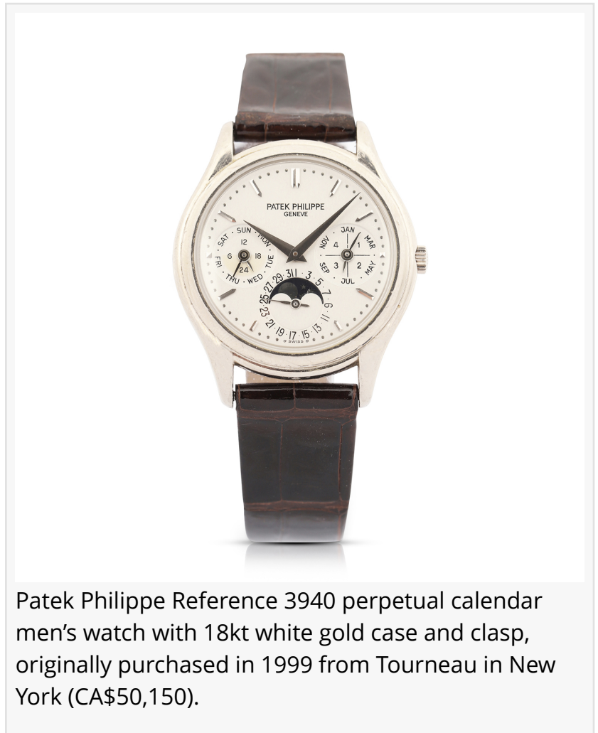
Patek Philippe Reference 3940 perpetual calendar men's watch with 18kt white gold case and clasp, originally purchased in 1999 from Tourneau in New York (CA$50,150).

The auction was filled with a generous offering of pocket watches unlocked from longtime collections; railroad grade pocket watches from Waltham, Elgin, E. Howard Co., Ball Watch Co., Hamilton, Illinois, and many more; vintage and modern wristwatches from luxury brands such as Rolex , Patek Philippe, Omega, Longines and others; and a select jewelry offering of rings, necklaces, bracelets and many other investment-grade pieces.