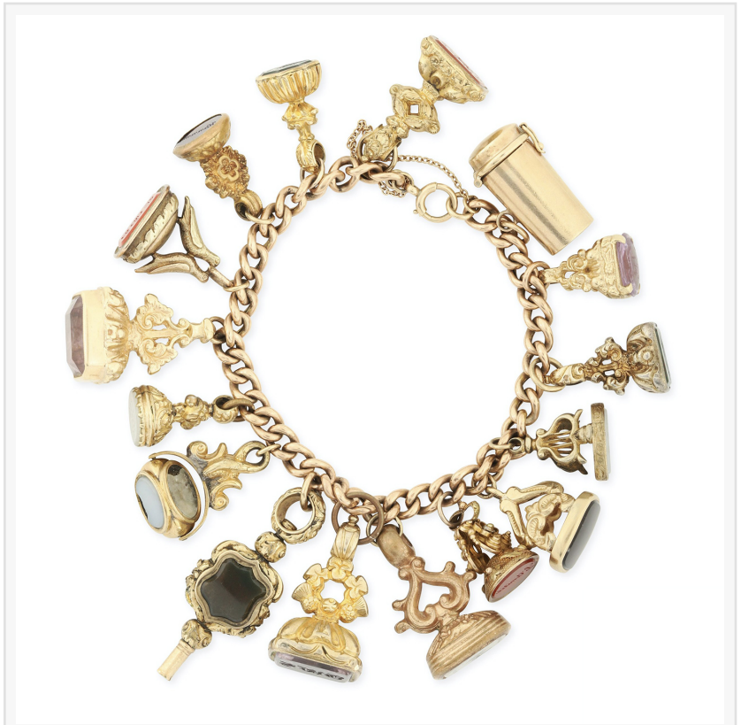
Victorian intaglio seal charm bracelet, 9kt to 18kt gold, with 16 charms, including a 9kt gold cigarette holder marked "Dunhill .375" and a pocket watch key (CA$4,425).

This press release can be viewed online at: https://www.einpresswire.com/article/543988336 EIN Presswire's priority is source transparency. We do not allow opaque clients, and our editors try to be careful about weeding out false and misleading content. As a user, if you see something we have missed, please do bring it to our attention. Your help is welcome. EIN Presswire, Everyone's Internet News Presswire™, tries to define some of the boundaries that are reasonable in today's world. Please see our Editorial Guidelines for more information. © 1995-2021 IPD Group, Inc. All Right Reserved.