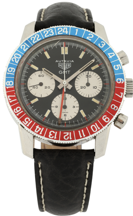
Tag Heuer Autavia GMT 2446C watch from 1972 featuring an amazing Pepsi bezel (the color of which still pops) and original pushers and crown (CA$17,700).