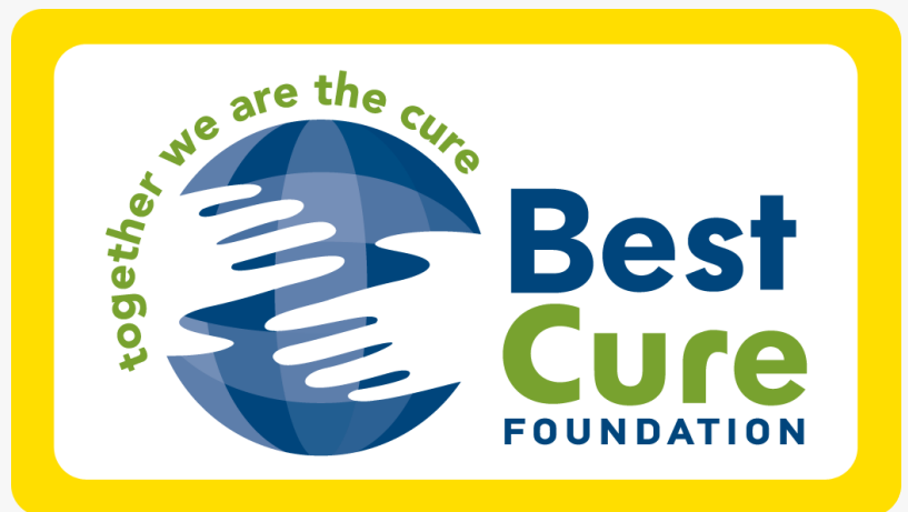
Best Cure Foundation — www.bestcure.md