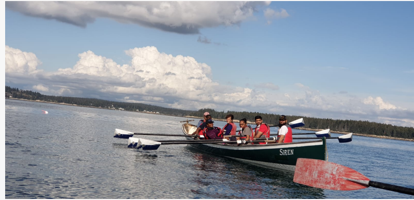
UPG Sustainability Leaders completing an activity on water together

communities. Countries that are highly represented in the Class of 2021 include: Nigeria, Brazil, Afghanistan, India, Kenya, Ghana, Egypt and Pakistan among a total of 101 countries and territories. The full list is available.