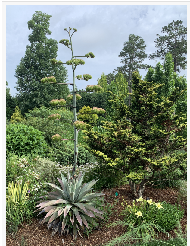
Juniper Level Botanic Garden – Raleigh, North Carolina

“We’ll be giving away pads of prickly pear cactus to our visitors at our Summer Open Garden,” said Avent. “I’ve always been fascinated with cactus, so we