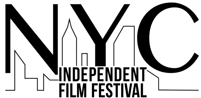
Logo NYC Independent Film Festival