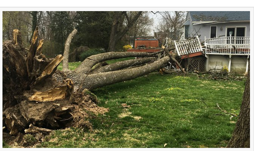
Dead Ash Trees can become brittle and dangerous.

The adult borers swarm the tree and lay eggs under the bark. Once the larvae emerge, they immediately start chewing their way through the wood of the tree. The veins in the grains of the tree allow water to flow through the tree, so when the larvae chew through the wood, they cut off water circulation. Additionally, the adult beetles create thousands of exit wounds as they leave the tree, further causing damage that dries out the tree.