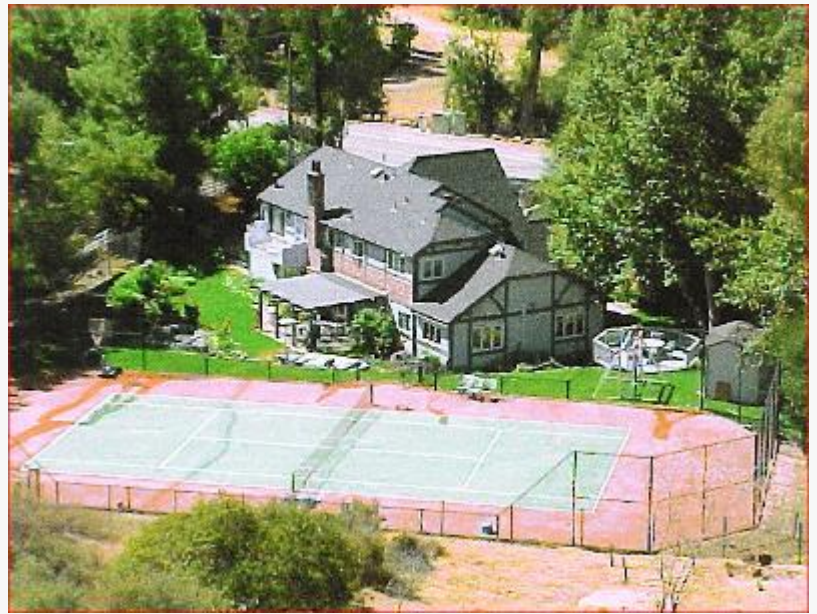
Polo G Calabasas Home

Diamond's last (good-luck) house in Tarzana went to Jamie Foxx, again well before Jamie's first #1 hit record and before his first feature film with co-star