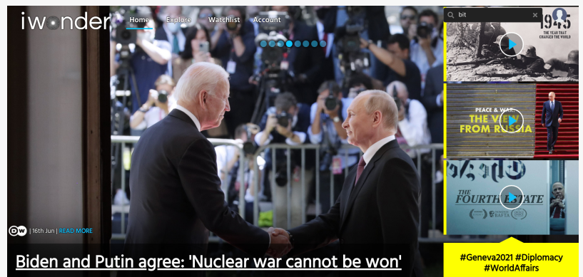
iwonder combines breaking news from around the world with documentary recommendations