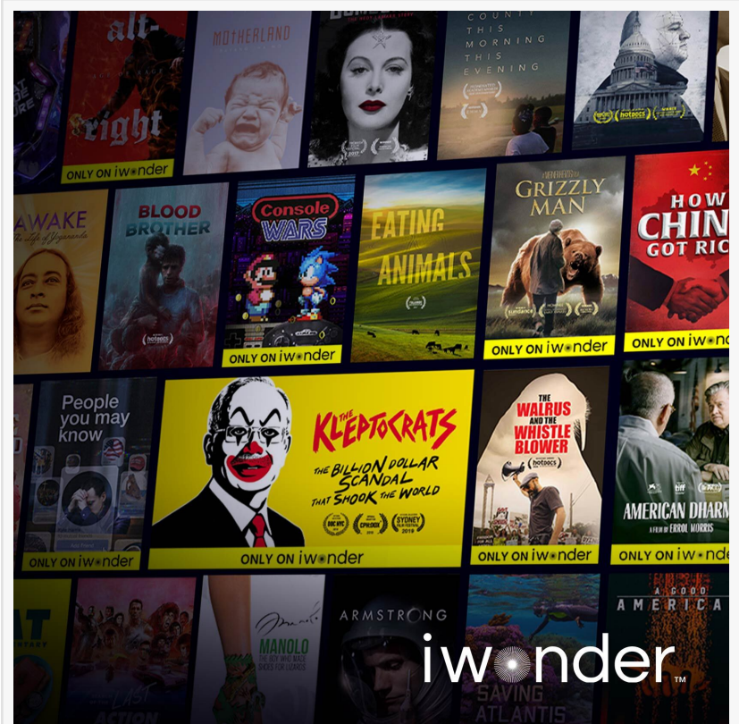
iwonder arrives in India with selection of world's top documentaries

Already available across Southeast Asia, South Asia, Hong Kong, Australia and New Zealand, where the service has been growing a fanbase of documentary fans since 2019, iwonder's bulging library of festival favourites and critically acclaimed films provides an in-depth