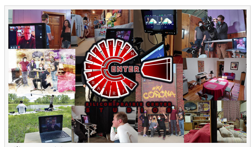
Silicon Prairie Center

The creative spirit of filmmaker Kirk Zeller was not thwarted by the social